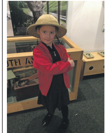
Torquay Museum for children