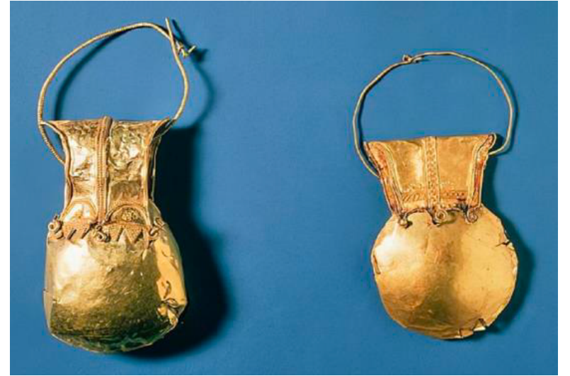
Two gold bullae from Herculaneum. 1st century AD