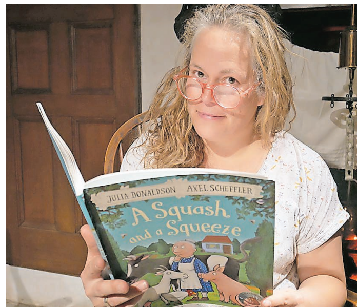
Storytelling in the Old Devon Farmhouse for little ones

Saturday, March 26, is also World Earth Day.