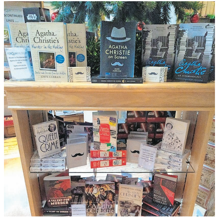
One of many displays full of Agatha Christie novels and merchandise

Staff have been working to make Torquay Museum a go to place to discover special gifts. In store, staff and volunteers are always on hand to offer helpful advice for