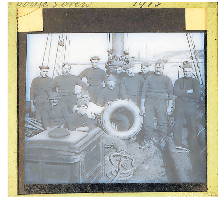
The crew of 'Collie' in 1913, the first Brixham trawler said to have had an elliptical