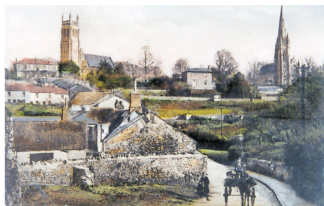
Barewell Road, circa 1900