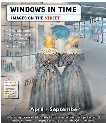
The Windows in Time exhibition is a free, outdoor trail of historic images of the area, sited close to where they were originally taken