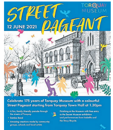
A pageant through the streets of Torquay will help celebrate the museum's 175th anniversary