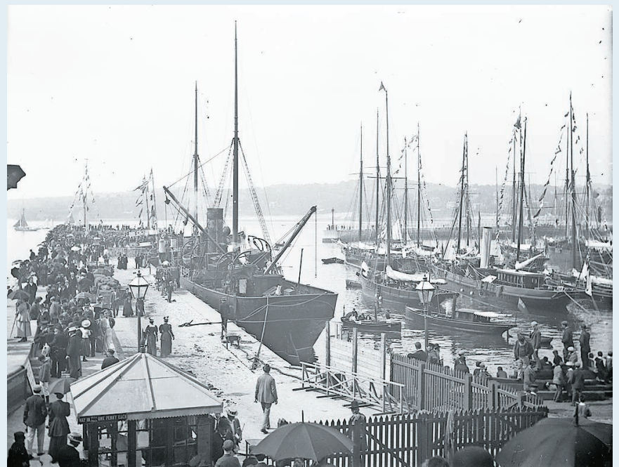
A glass negative of the Centenary of Torbay Royal Regatta, August 1913 (PR17591)