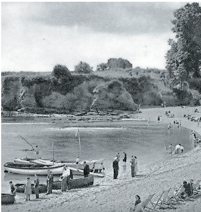
Corbyn Head in 1953 (PR4871)

Photographs from the museum's archive can be purchased by quoting their PR number to enquiries@torquaymuseum.org. The museum is a registered charity and the money raised from purchasing images goes to supporting vital work looking after the collections.