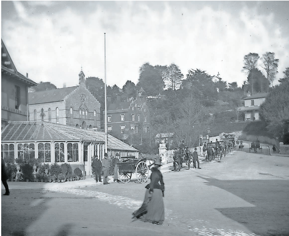
Castle Circus circa 1900 (PR32580)