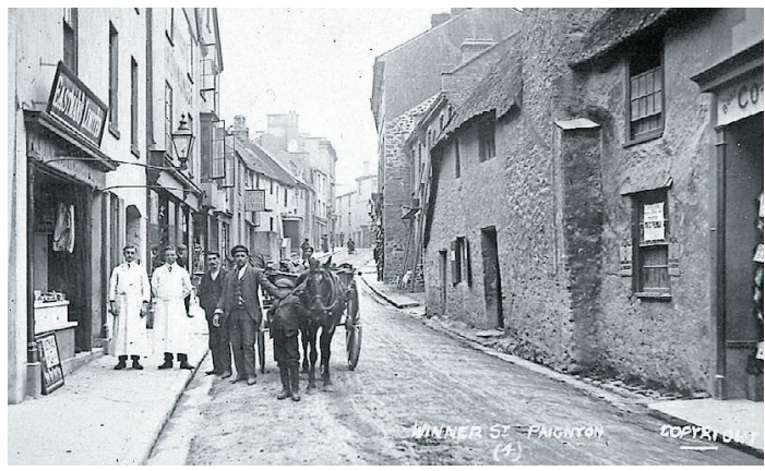
Eastman's Butchers' staff in winter 1905

• Photographs from the museum's archive can be purchased by quoting their PR number to enquiries@ torquaymuseum.org. The Museum is a registered charity and the money raised from purchasing images goes to supporting vital work looking after the collections.