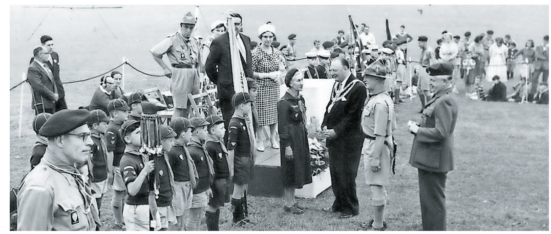
The inspection of Barton Scout Group prior to the official opening of their new headquarters at Barton Downs Playing Fields in