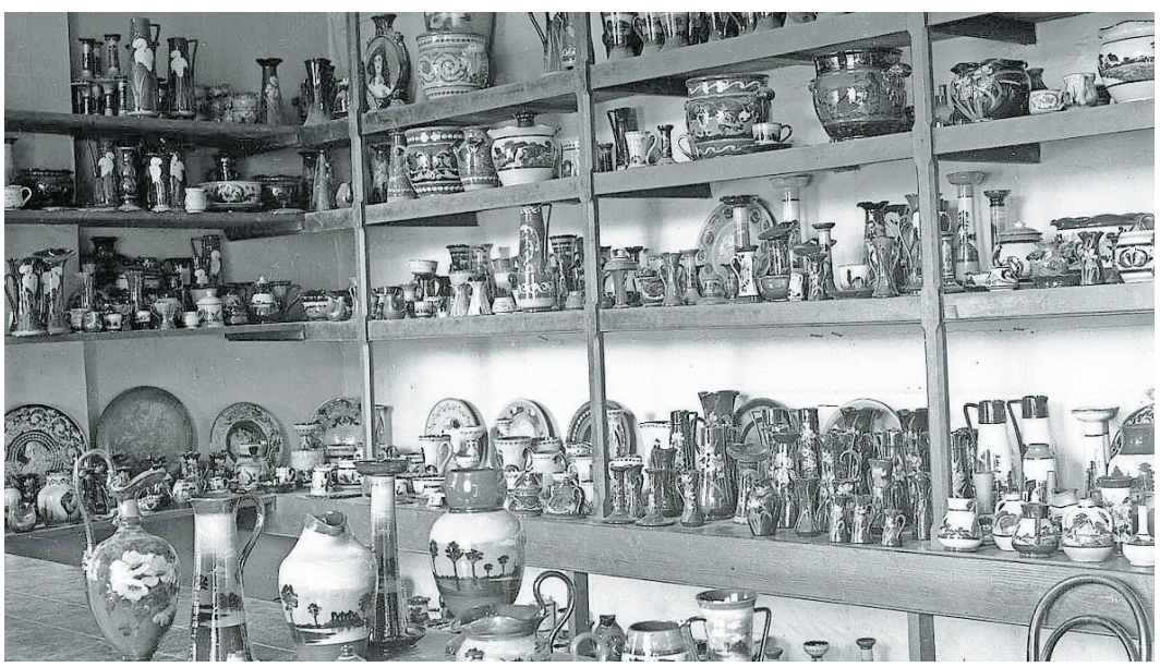
A display of products from Longpark Pottery (PR19357)