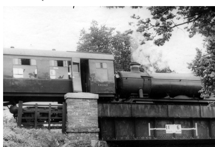
A railway accident on the bridge at Livermead, Torquay, in August, 1962 (PR7086)

Photographs from Torquay Museum's archive can be purchased by quoting their PR number to enquiries@ torquaymuseum.org. The museum is a registered charity and the money raised goes to looking after the collections