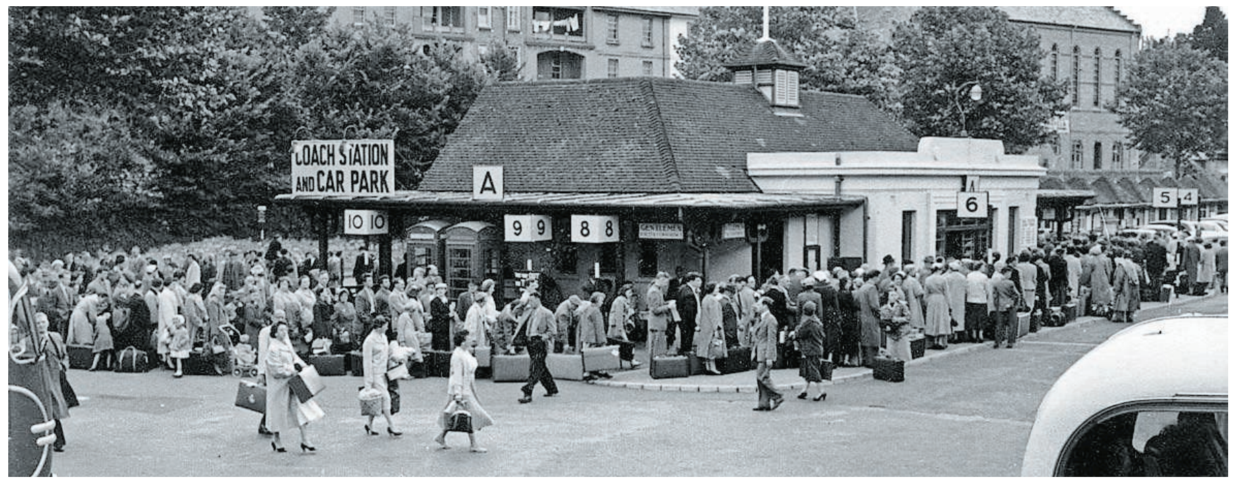
The coach station and car park near the town hall, Lymington Road (PR35105)